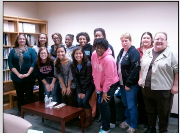
Martin Branch members join with UTM Student Group Women Leaders Working Locally Thinking Globally to watch Half the Sky Documentary.

The Martin Branch of AAUW participated in the first annual UT Martin Women’s Symposium in March 2011, sponsored by the UT Martin Women’s Center. As a result of their efforts to promote AAUW at this conference, they were able to add student members, members whose memberships had lapsed, and new members and now have 24 members.