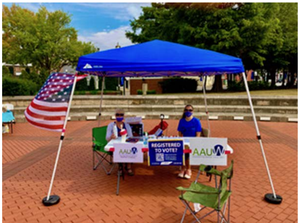
Voter Registration at the Bans Off Our Bodies March in Murfreesboro

On behalf of the AAUW Murfreesboro Branch, we hope all our fellow AAUW Tennessee members have a successful, happy, and healthy 2022 year. We are in this together!