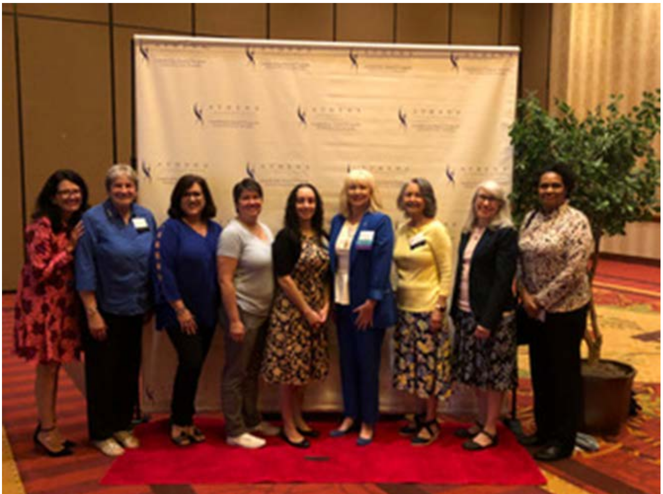
AAUW Murfreesboro at 2021 Athena Awards